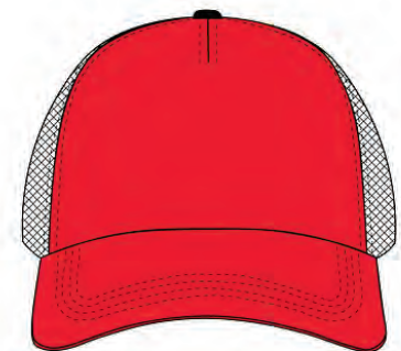
Color 43 - Cherry