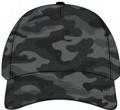
P31 - Black Camo