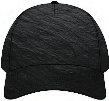
P17 - Black Slate