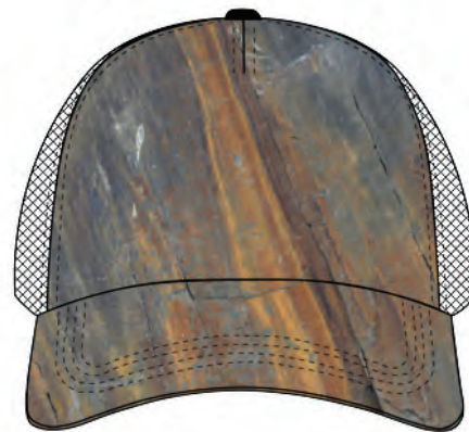
P15 - Slate