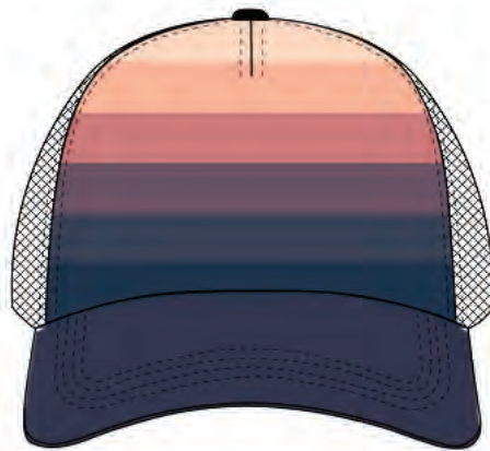
P07 - Mountain Sunset