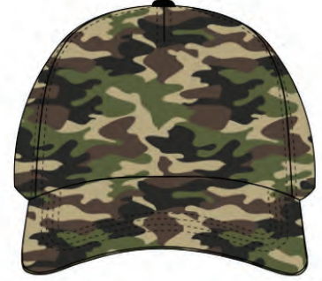
P26 - Classic Forest Camo