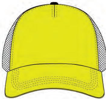
Color 35-Bright Yellow