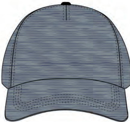
P03 - Grey Stripe