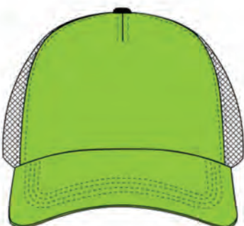
Color 29 - Lime