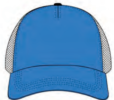
Color 18 - Blue