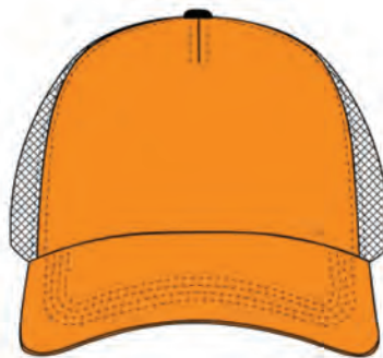
Color 38 - Gold