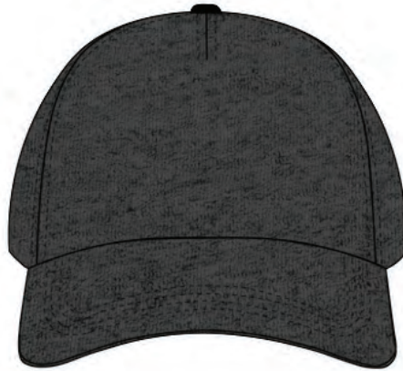
P25 - Charcoal Heather