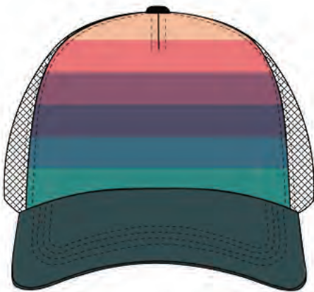
P08 - Tropical Sunset