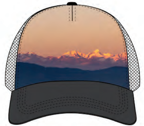
P39 - Mountain Sunset