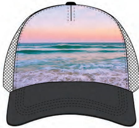
P40 - Beach Waves