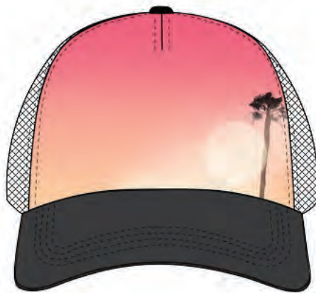
P41 - Beach Sunset