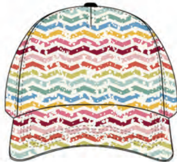
P37 - Rainbow Chevron