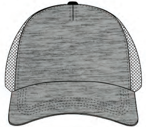
P24 - Dark Heather