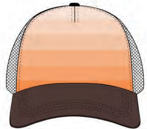
P11 - Orange Fade