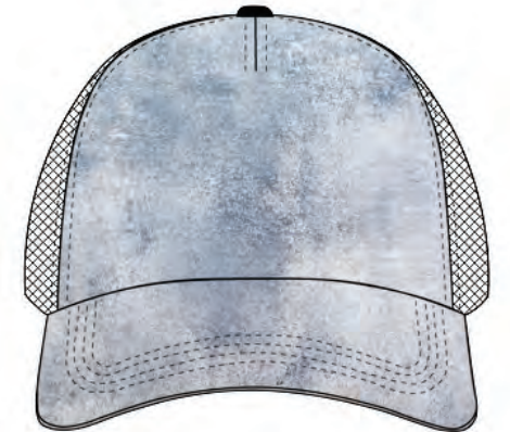
P18 - Canvas