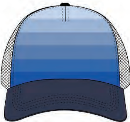
P09 - Blue Fade