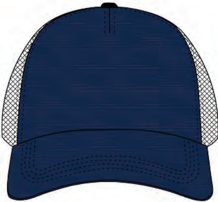
P04 - Navy Stripe