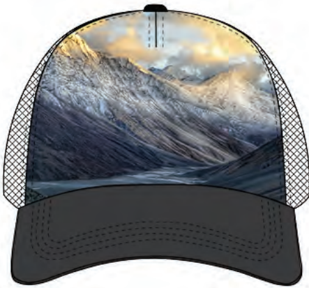
P43 - Mountain Yellow