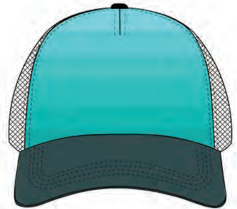
P10 - Teal Fade