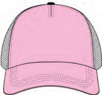
Color 14 - Pink