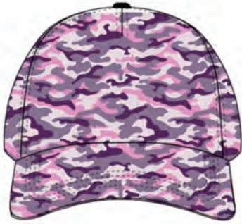
P30 - Pink Camo