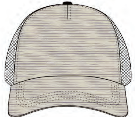
P05 - Tan Stripe